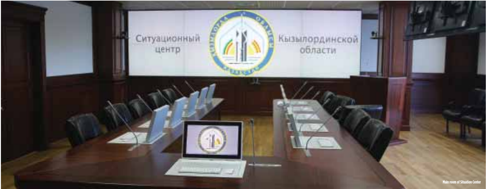
Main room of Situation Center

T he Kyzylorda oblast - a part of Republic of Kazakhstan - is marked by its vast geographical distribution of cities and their remoteness from regional centres. Governed by the Kyzylorda akkymat administration, the area's economy is dominated by the oil and gas industry, uranium mining and agriculture.